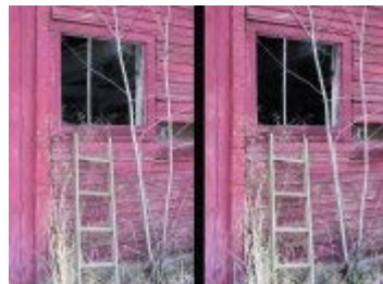
A new feature in CS2 is the High Dynamic Range function. This lesson shows you how you can combine several bracket images into one image that has an extreme exposure range.