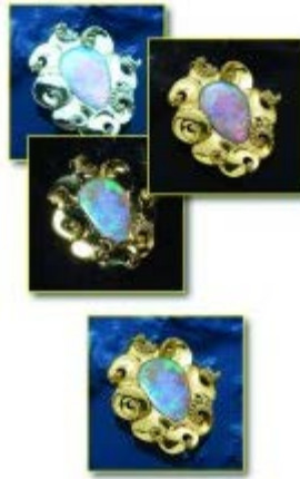
In this exercise you are shown how you can take the same subject, photographed with three different types of lighting, and combine the different shots into one impossible image.