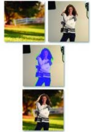
One of the more advanced lessons shows you how to extract extremely fine detail and combine it with a new background.