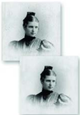
An entire lesson is devoted to the restoration of older images. It shows how you can use healing brushes, the clone tool and the history brush to make fast and accurate corrections to