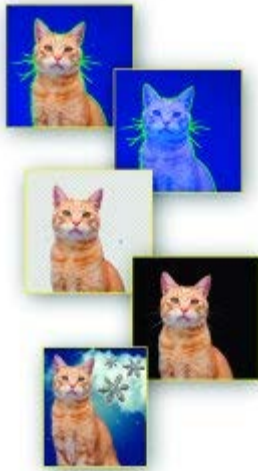
Another chapter devotes itself to the advanced plug-in filters used in CS2. In this case Julieanne shows the viewer how the extraction tools are used to select the edge of the cat, fill the selection, change the background, and add additional objects to the image.