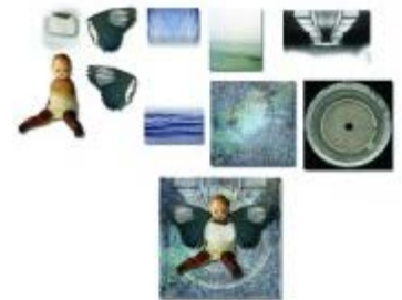
A layers exercise from her CS tutorial is repeated in this lesson, but it has been updated with the new features of CS2. This is a complex lesson that when completed correctly will give you a good understanding of layers.