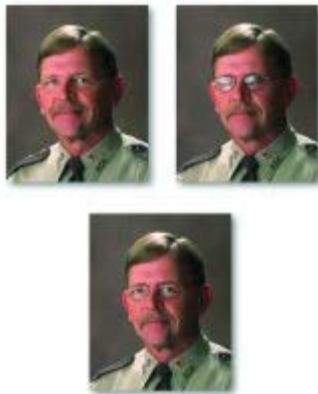
For portrait photographers having trouble shooting glasses, this lesson is perfect. Using two shots, Julieanne shows you how you can layer the images with masks and use the brush to remove the reflection on the glasses.