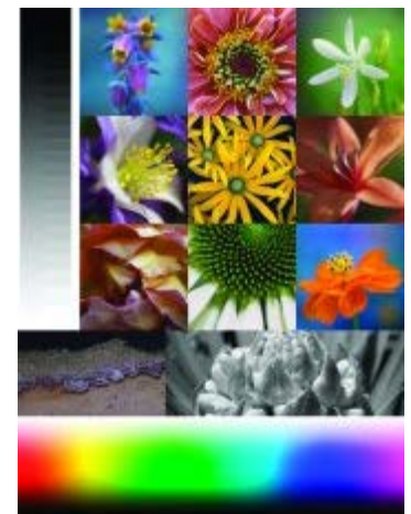
A special test chart is included with the lessons to help you create your own printing profile.