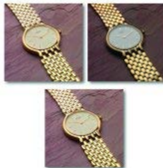
Another lesson on layers shows you how to use layers, masks and selection tools to make a composite image from two images of the same watch in different lighting.