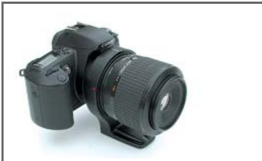
Canon MP-E 65mm f/2.8 Macro Lens