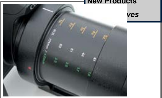
Magnification ratios engraved on lens barrel.

This is a fully manual focus camera with a range from 4 inches at 1X to 1.6 inches at 5X. As you expand the lens, there is a magnification scale to provide accurate magnification readings. Electrical contacts on the back of the lens communicate information to the camera regarding lens mode, lens type, metering information, focal length, and absolute distance of the lens. Because of the unusual construction of the lens, it is not compatible with extension tubes, extenders, or additional closeup filters.