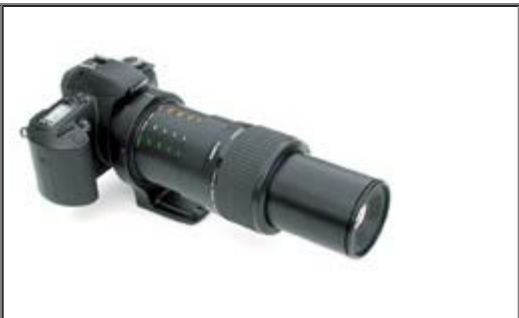
Canon MP-E 65mm f/2.8 extended.