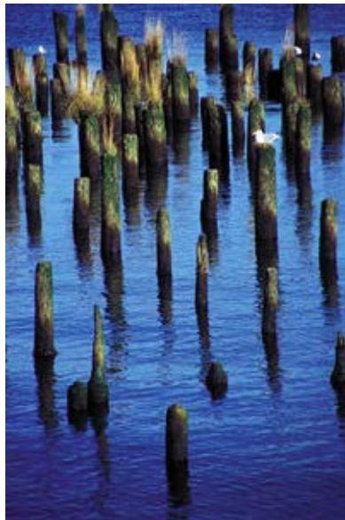
The harsh contrast of direct coastal afternoon sun presented no problems for new Fujichrome Astia 100F. Highlight and shadow detail are excellent.