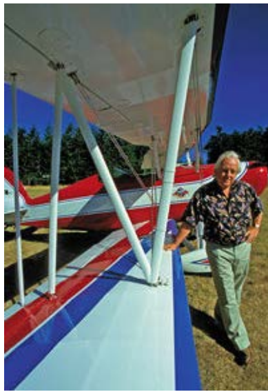
Astia 100F reproduced the colorful biplane and its owner faithfully in bright sunlight.

When we passed a small airport, we realized that a vintage plane fly-in was on display for us to test. Who squealed and told them we were coming? This was a job for the 14mm. The proud plane owners were more than cooperative when it came to posing with their pride and joy. It wasn't long before some color, design, and perspectives were all captured on the new Astia 100F emulsion.