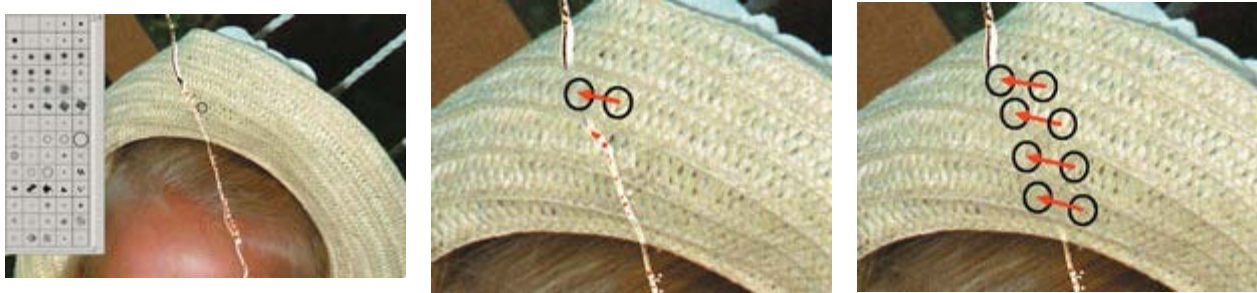
Use the clone tool to drag and drop data from areas next to the scratch. Data was copied from areas parallel to the tonal range in the straw hat.

To best hide your editing, you must carefully monitor tonal changes along the scratch throughout the image. Drag and drop your data parallel to the tonal values along the scratch.