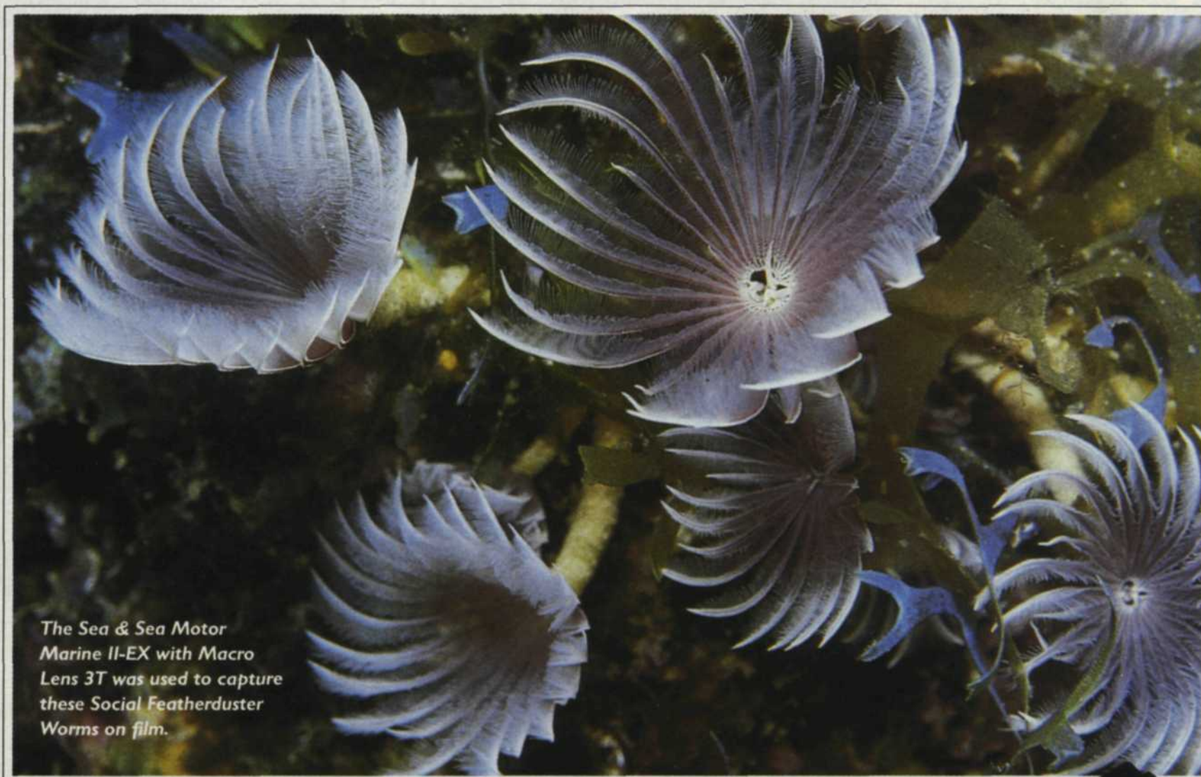
The Sea & Sea Motor Marine II-EX with Macro Lens 3T was used to capture these Social Featherduster Worms on film.

TEXT AND PHOTOGRAPHY BY JACK AND SUE DRAFAHL