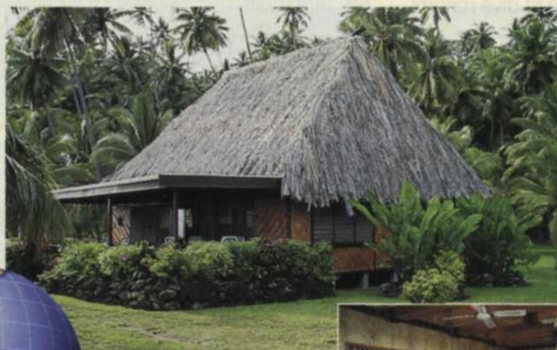
Above: Latticed Butterflyfish (Chaetodon rafflesi). Each bure at Fiji Forbes Laucala is fully furnished with kitchen, mini-bar, one or two bedrooms, private bath, living room and dining area.

Stress reduction is the main concern at Forbes, so schedules be damned. You can have it your way with dining, diving and island activities. Breakfast is prepared and served in your bure by your very own bure girl. You tell her what you want, when you want it and she will prepare it in minutes from the fully stocked kitchen. You can enjoy lunch just about anywhere; in your bure ,