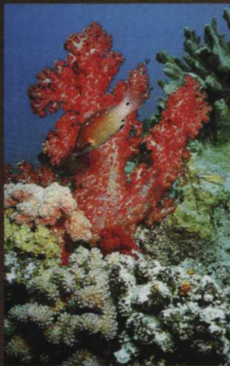
The reefs off Kadavu present some of Fiji's finest diving, with a colorful array of soft and hard corals. Inset: A welcoming Fijian smile.

Kadavu, pronounced "Kanda-voo," is the fourth largest of the more than 300 Fijian islands. Sixty miles south of Viti Levu, it is 37 miles long, with elevations up to 2,953 feet. Kadavu's terrain is so rugged it is virtually undeveloped. A huge virgin coral reef forms a ring around the island, which has a popula-