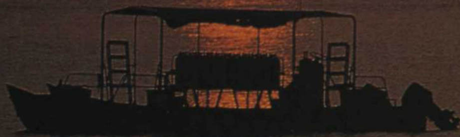
Background: Dive Kadavu's boat in silhouette on a tranquil sea.