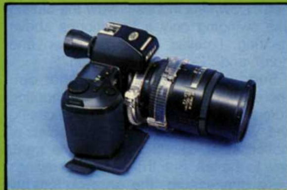
The 8008 camera with 28-85mm lens.

Equipped with the auto focus 28-85mm lens, the Nikon 8008 camera offers everything from macro to wide angle to zoom. The Super-Eye viewer delivers a bright image. Ikelite's SLR-AF housing adapts to the features of the camera and options include a dome port, extension port, extension port with focus, and several strobes.