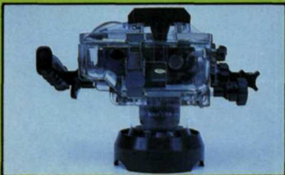
The housing has a protected dome port.

For more information and/or an Ikelite catalogue write the company at 50 West 33rd, P.O. Box 88100, Indianapolis, IN 46208.