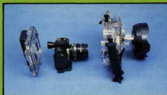
The housing back seals with an O-ring.