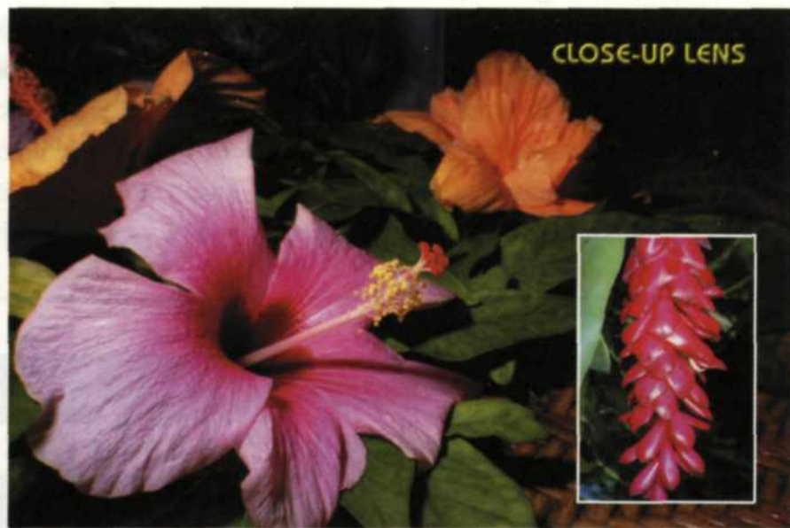
An "inner" bevel was added to the background layer here, using Eye Candy plug-in software.

Since Adobe Photoshop is one of the most popular image-editing programs, and has outstanding layering commands, we decided to use it as our model for this article.