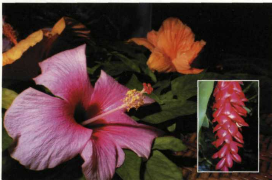
This layered image was used in a Sea & Sea promotional catalog. This is the first of two versions of a layered image presented to the client, and the two layers were enhanced with a white border using the stroke command.