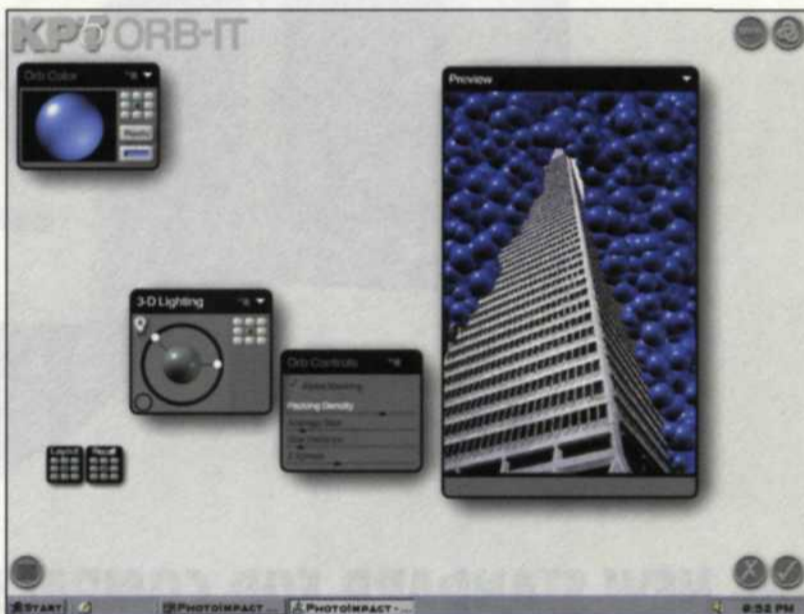
Orb-it screen with default glass spheres

Recently, we had the pleasure of working with a new editing program from Ulead System called PhotoImpact 4.1. At about the same time, we also received a plug-in program from MetaCreations called KPT5. As we surfed through the PhotoImpact program, we discovered that it would accept these new KPT5 plug-ins, even though they were primarily designed for Adobe Photoshop.