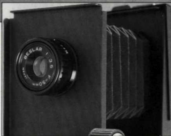
Cadet II lens and bellows.

A small printing guide in the kit explains how to load the negative into the